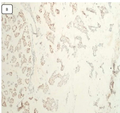
Figure 2. Positive expression of immunohistochemistry of Ki-67 (200 x).